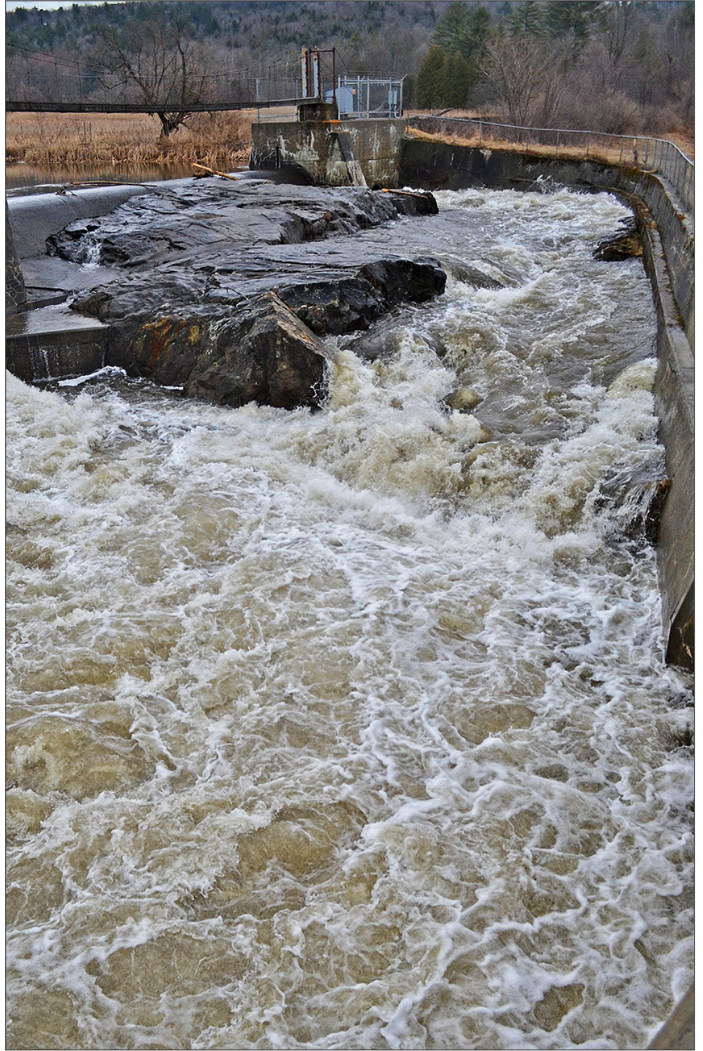
Water flows rapidly on Jackson Dam in Hardwick on April 1.